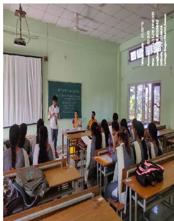
Student of B. A. 3 rd Sem Honours presenting their papers