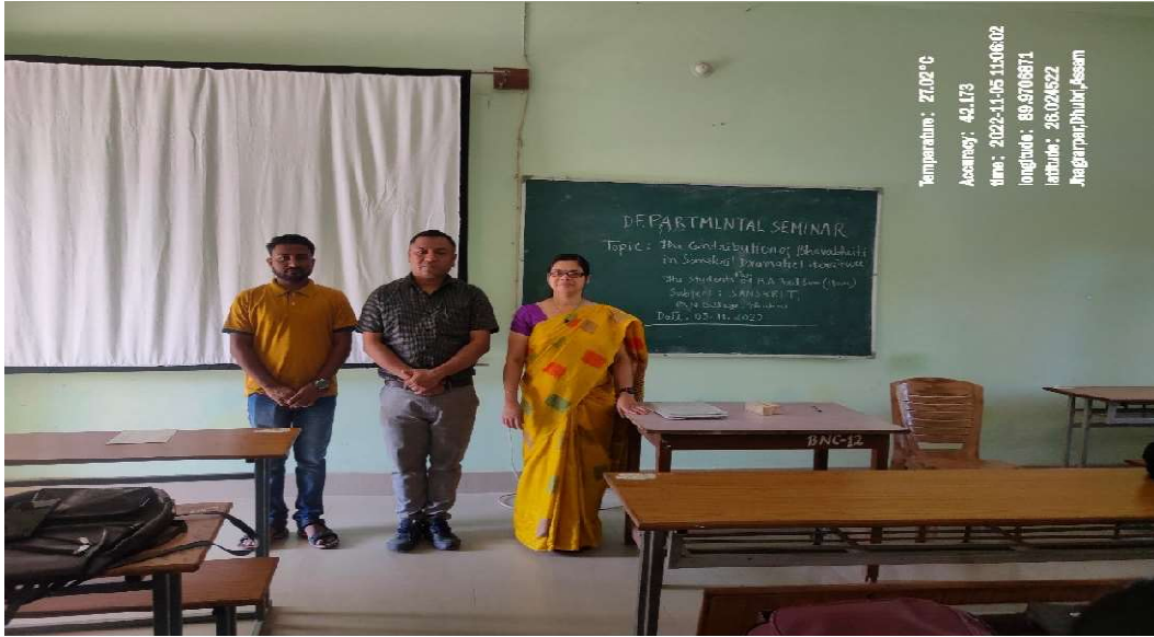
Faculty members of Sanskrit Department present in the Departmental Seminar